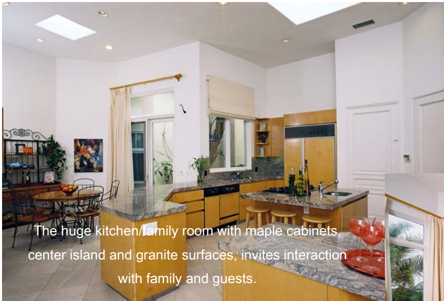
The huge kitchen/family room with maple cabinets, center island and granite surfaces, invites interaction with family and guests.

Imagine coming home and relaxing in your pool while enjoying the view!